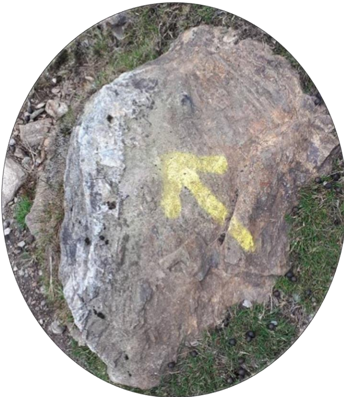
Poor Event Planning Practices

If way marking/directional/temporary signs are to be used, a considered approach must be taken to reduce impact on environment. All temporary signs must be removed after the event and a procedure for this should be agreed in advance. Paint should never be used on any surface to provide information to participants. Signage, including cable ties or other fixings should always be removed post event and nails/ staples should never be used to attach temporary signage to trees/ shrubs.